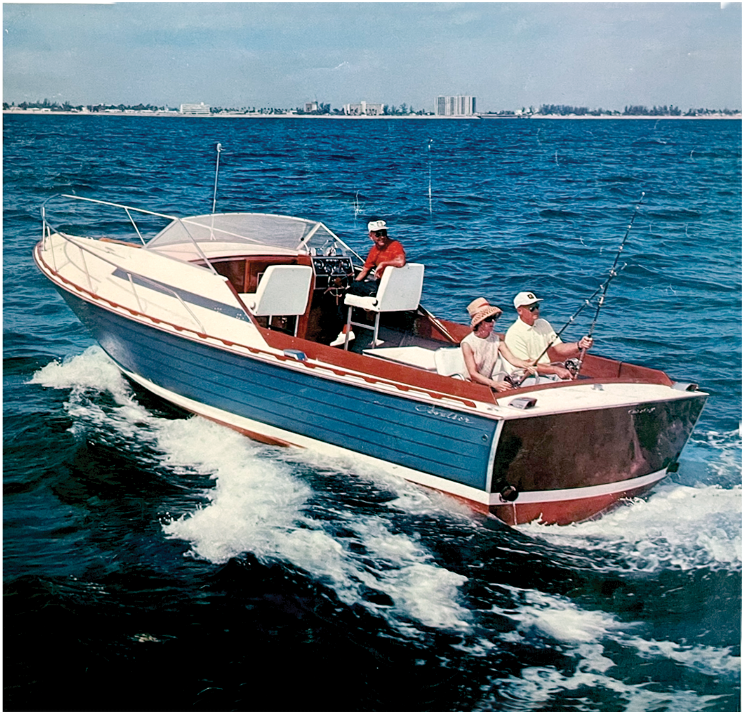
Fiberglass bottom covering and bow rail are optional extras.